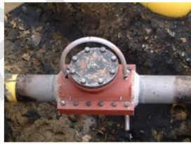
Figure 2 - Existing Grouted Tee technology