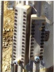
Figure 1 - Existing Epoxy Repair clamp