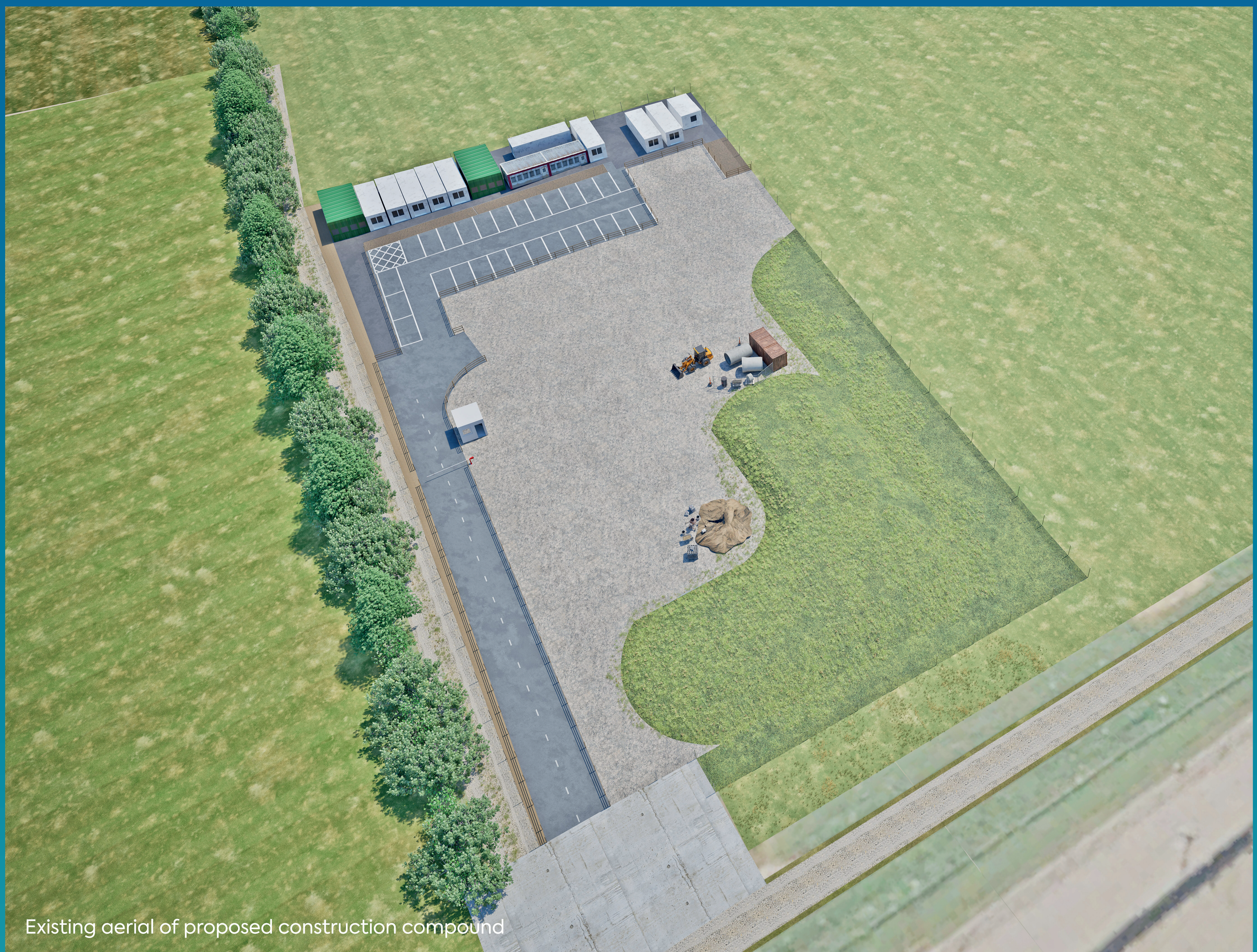
Existing aerial of proposed construction compound