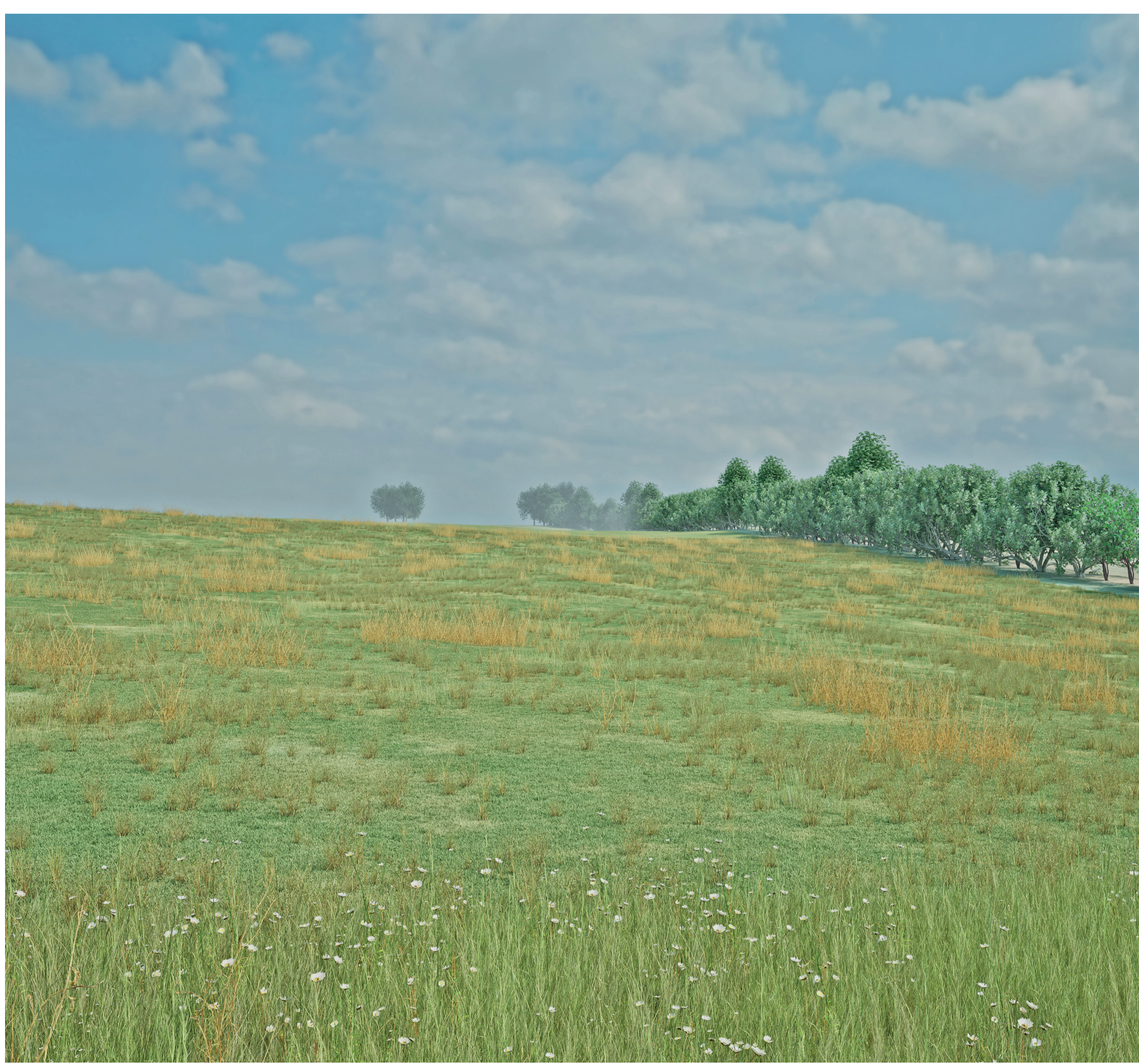
View from Hall Farm Road