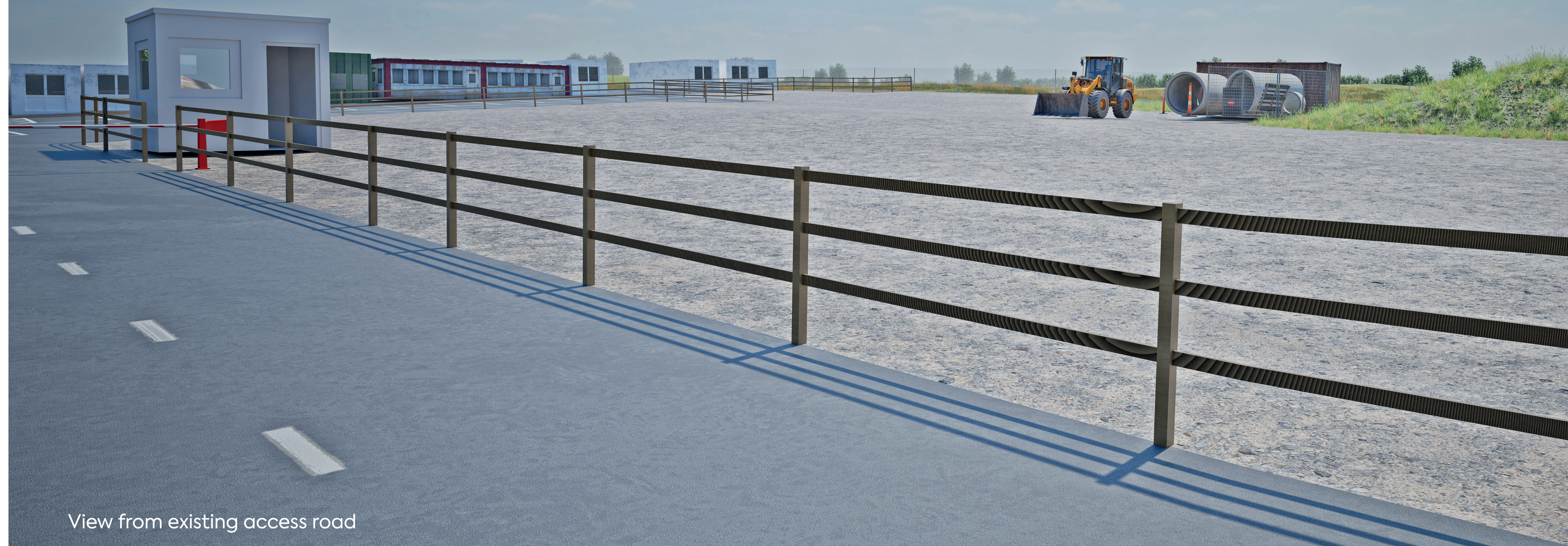
View from existing access road