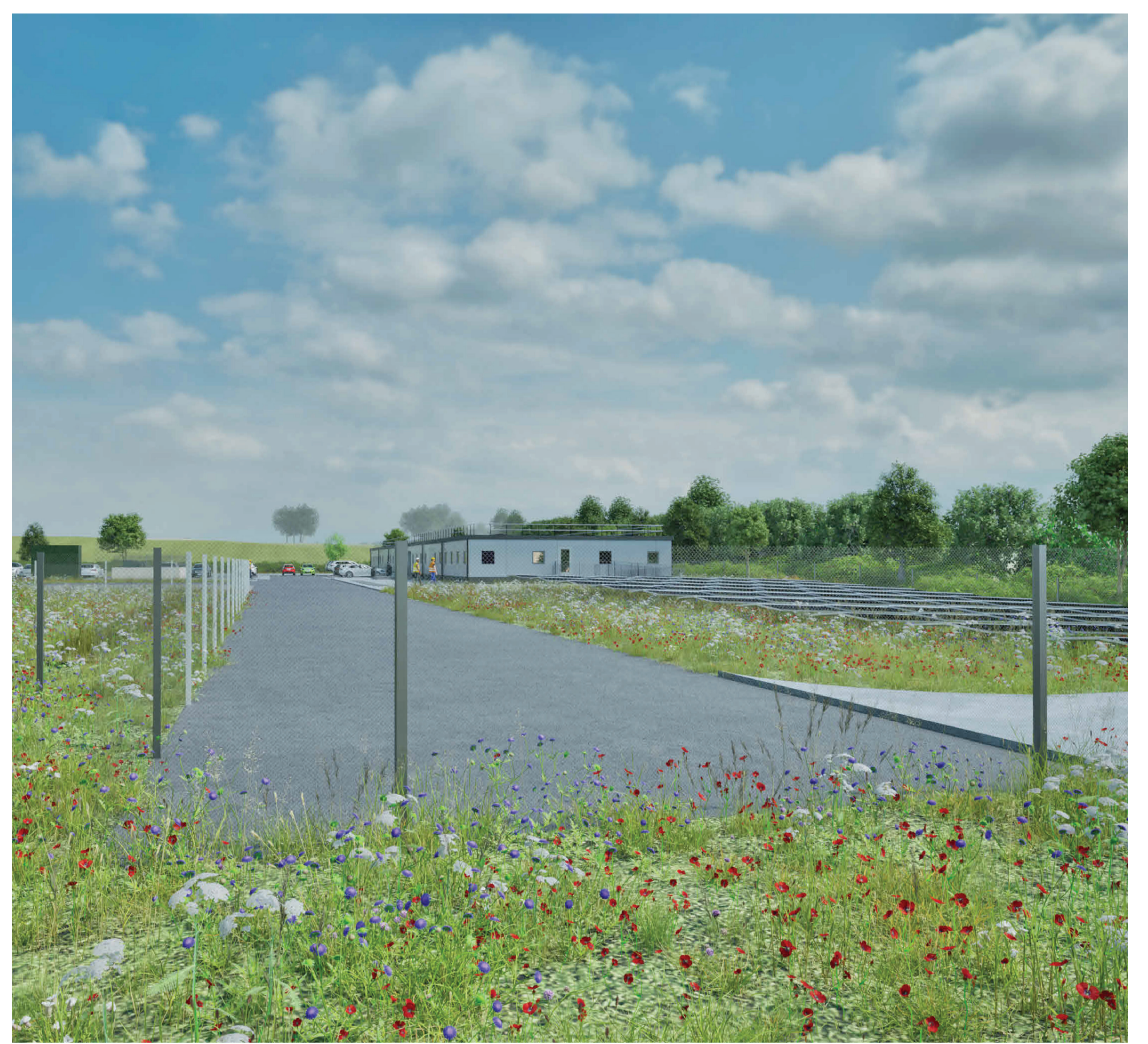
Proposed view from Hall Farm Road