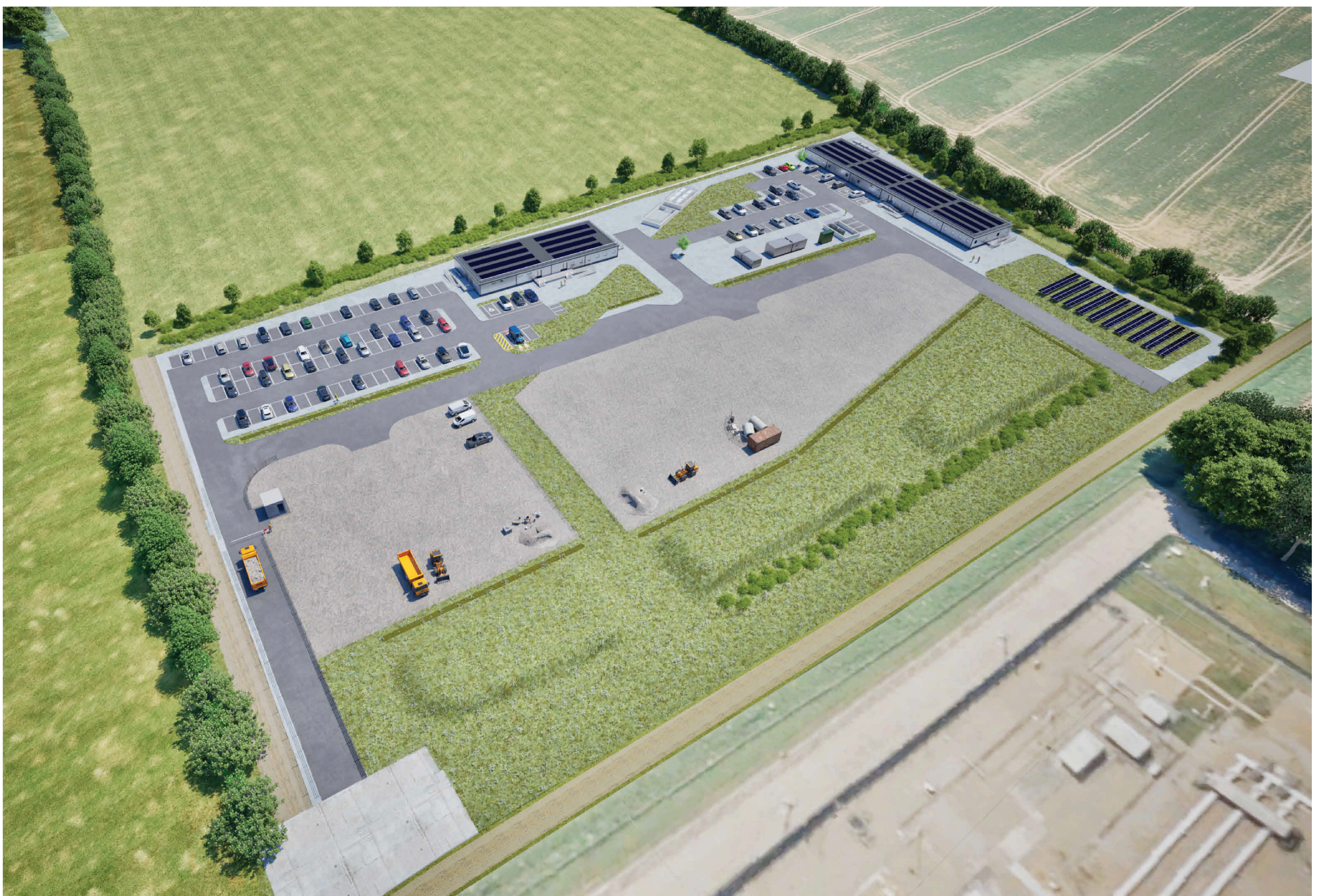
Proposed aerial view of the Bacton Temporary Construction Compound